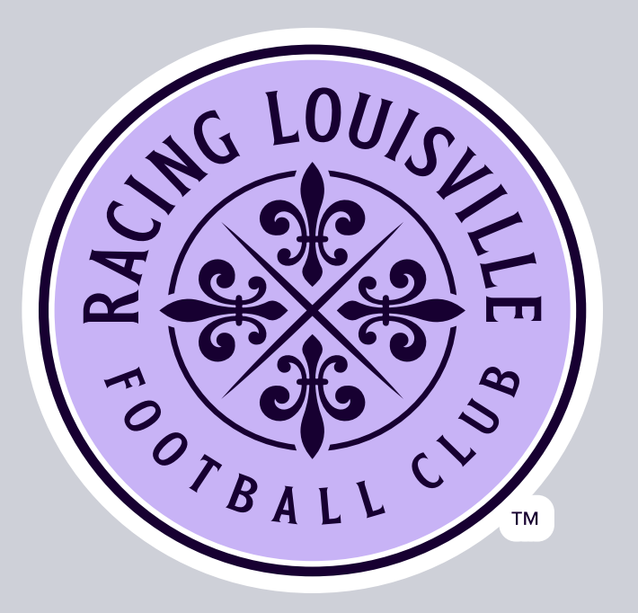
Do not add a stroke to the logo.