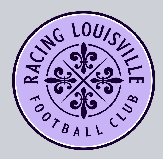
Do not remove the trademark symbol.