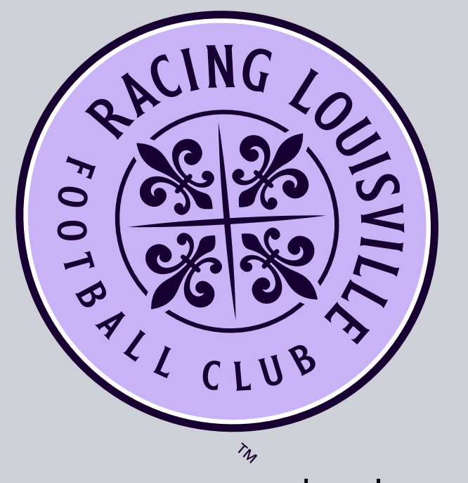
Do not rotate the logo.