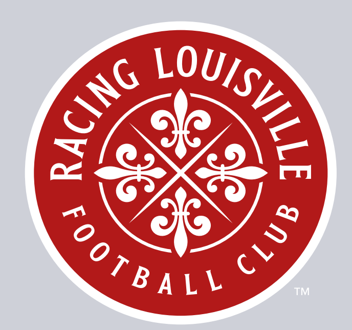
Do not alter the colors of the logo.

Altering the logo in any way is not permitted. Examples of incorrect use include: