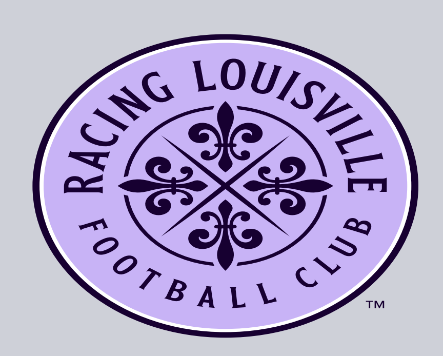
Do not stretch the logo. Scaling should be done proportionally.